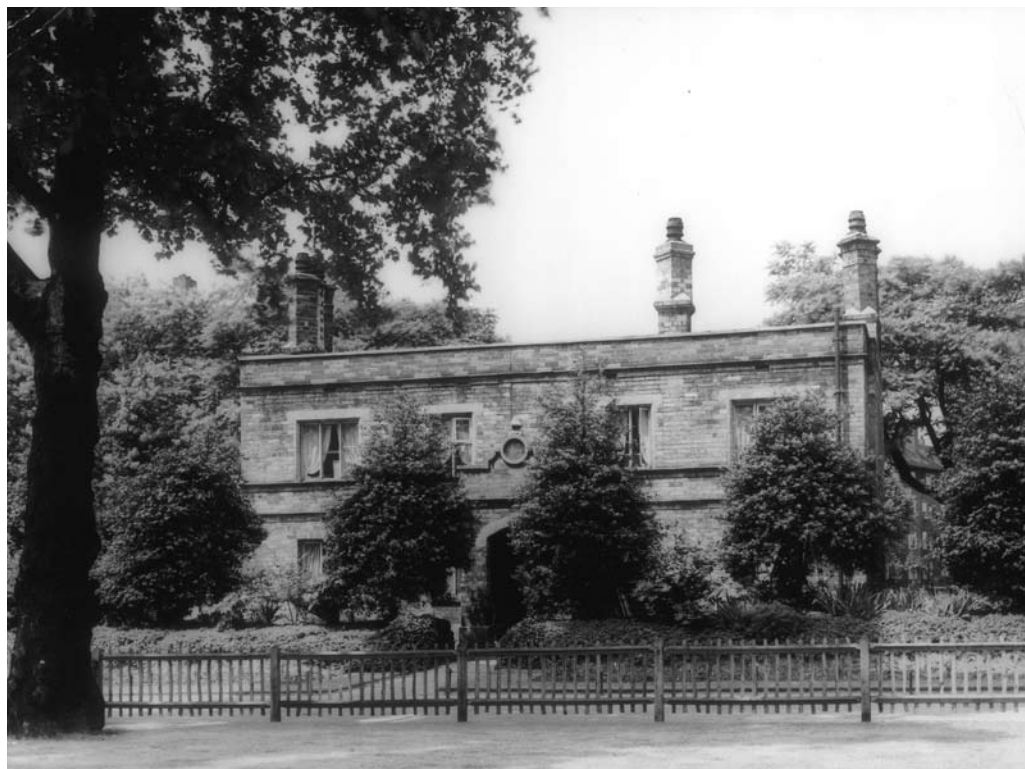
Prince Consort Lodge - a Chartist legacy for Kennington Park

Seen in this light, the Lodge is the only 'memorial' in the park to recognise its connection with the Chartists. At some point in the future this may be put right so that Kennington Park's place in the history of working class politics is acknowledged, remembered - and honoured.