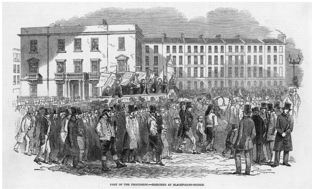
PART OF THE PROCESSION.—SKETCHED AT BLACKFRIARS-BRIDGE.

The huge march took an hour to pass over Blackfriars Bridge